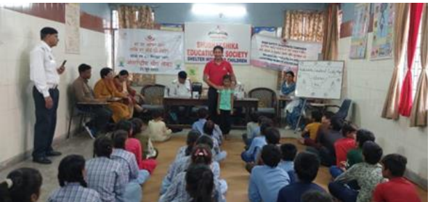
Children attending workshop on Disaster Management