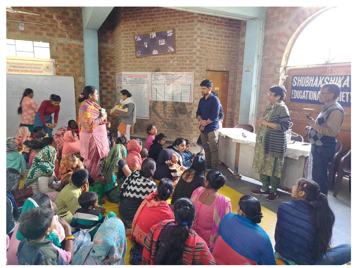
Counselling session on Drug Abuse, Women Literacy and Computer Education (Feb 24, 2024)

In observation of the fact that supporting disadvantaged children cannot be achieved in isolation, and that their families need to be uplifted as a unit, we decided to channelize a part of our bandwidth and resources to women empowerment. We have commenced a pilot project for women in Shahbad Dairy, that we plan to grow as we learn. The project, named Sashakta Naari , is focussed at inculcating confidence and self-respect in women, equipping them with the necessary awareness and knowledge to deal with issues like domestic violence, family planning and addiction in families, and possibly generating employment for them. We plan to achieve this through workshops and community awareness programs. Two women volunteers from Shahbad Dairy have been engaged (on a paid basis), who would be our torch-bearers for the project. The volunteers shall be duly trained for the task.