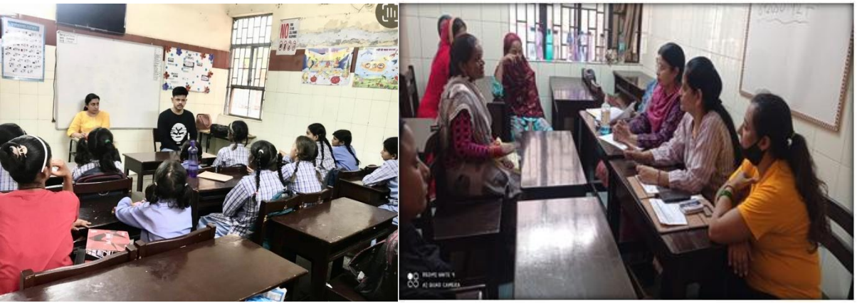
Group counselling for girls